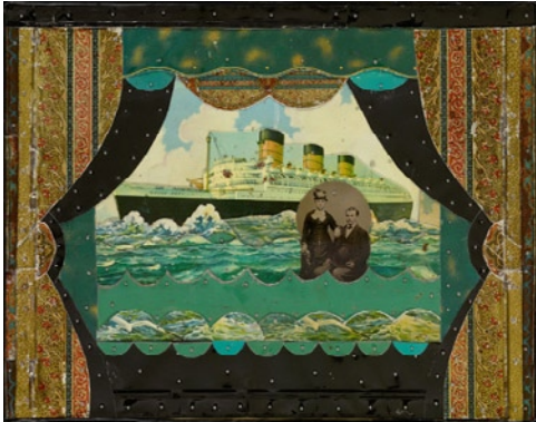
Nia Michaels The Voyage Tin Assemblage