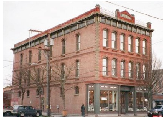
The 1885 Waterman & Katz building

A capital campaign is now underway to purchase a Port Townsend landmark, the 1885 Waterman & Katz building, and make it their new home. We hope to have the NWDC show at this new, exciting location right in the center of downtown Port Townsend.