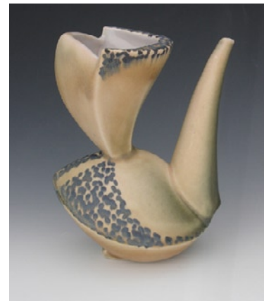
Deb Schwartzkopf Oil Purer Porcelain