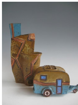
Rob Beishline Road Trip Ceramics