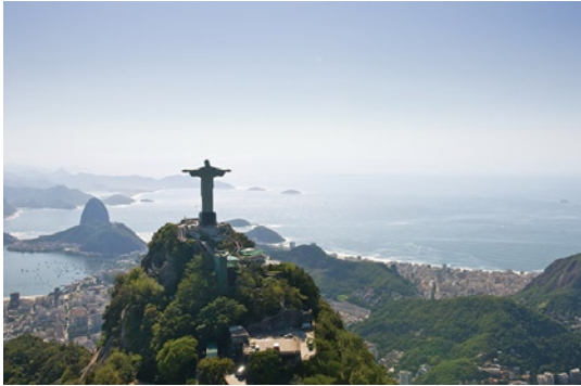
Rio Christ the Redeemer