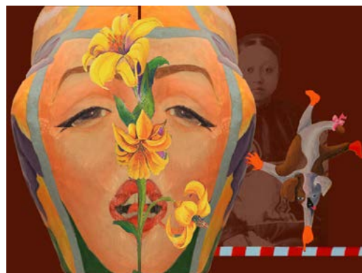
Image: Cheryll Leo-Gwin Tricks of the Trade (Series of 12 prints) 2016 19”h x 22”w Digital Collage

A one person exhibition - FareWell Sammamish City Hall Commons Gallery 801 228th Avenue SE Sammamish WA 98075 November 2016 - January 2017 Opening November 6 from 6:30-8:00PM