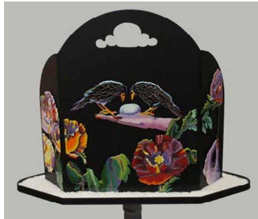
Image: Cheryll Leo-Gwin FareWell (detail view) 2016, 48”h x 24”w x 20”d Vitreous enamel on copper, stainless steel, cast iron, rice, acrylic http://www.bellevuearts.org/exhibitions/bam-biennial-2016.html

BAM Biennial 2016: Metalmorphosis Bellevue Arts Museum, Bellevue WA