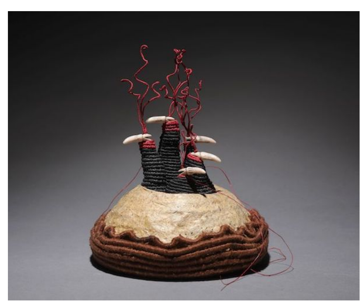
Danielle Bodine Four and Twenty Black Birds Baked in a Pie Coiled linen, cast mulberry paper, bone beads, wire