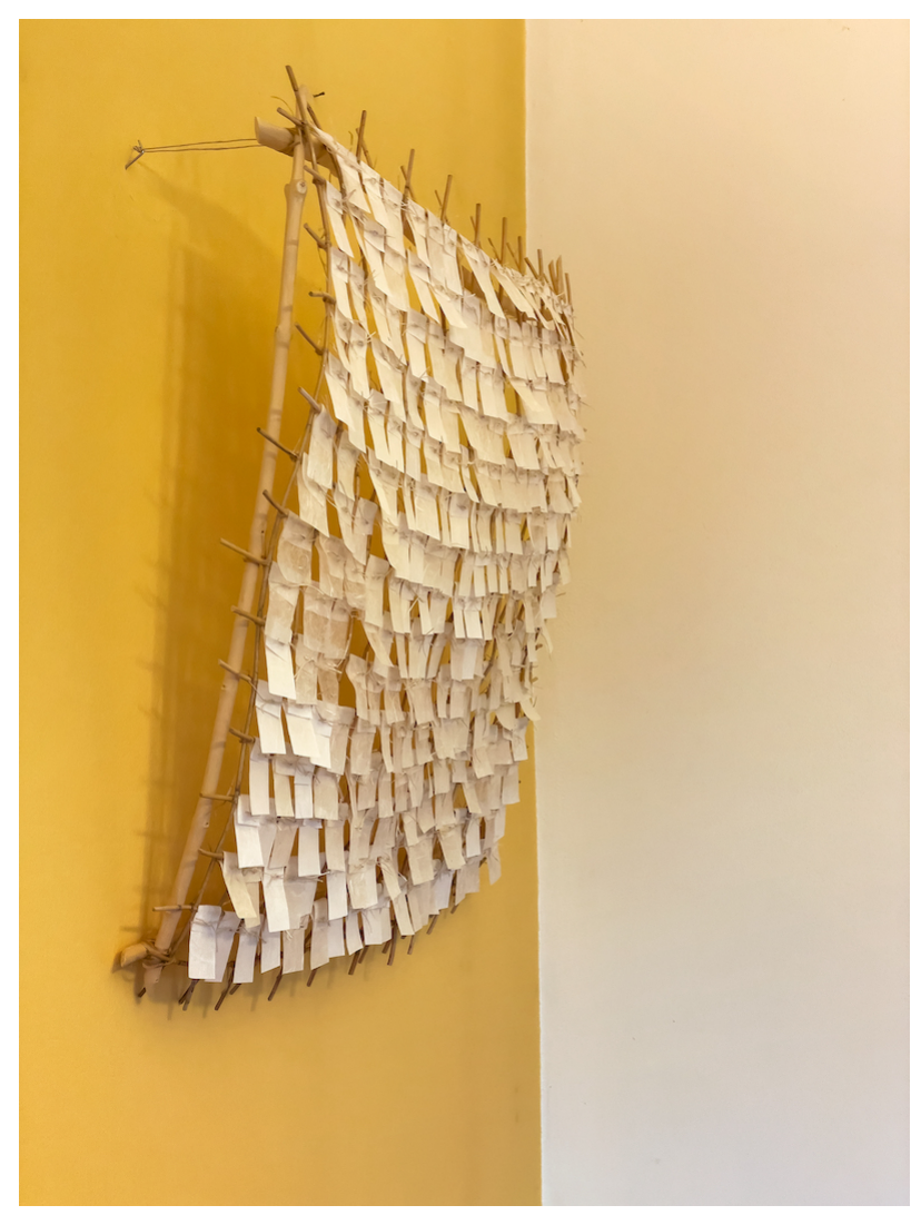
Denise Snyder Many Tranquil Moments 26 x 29 x 4" Rattan Vine, handmade paper, found wood, linen