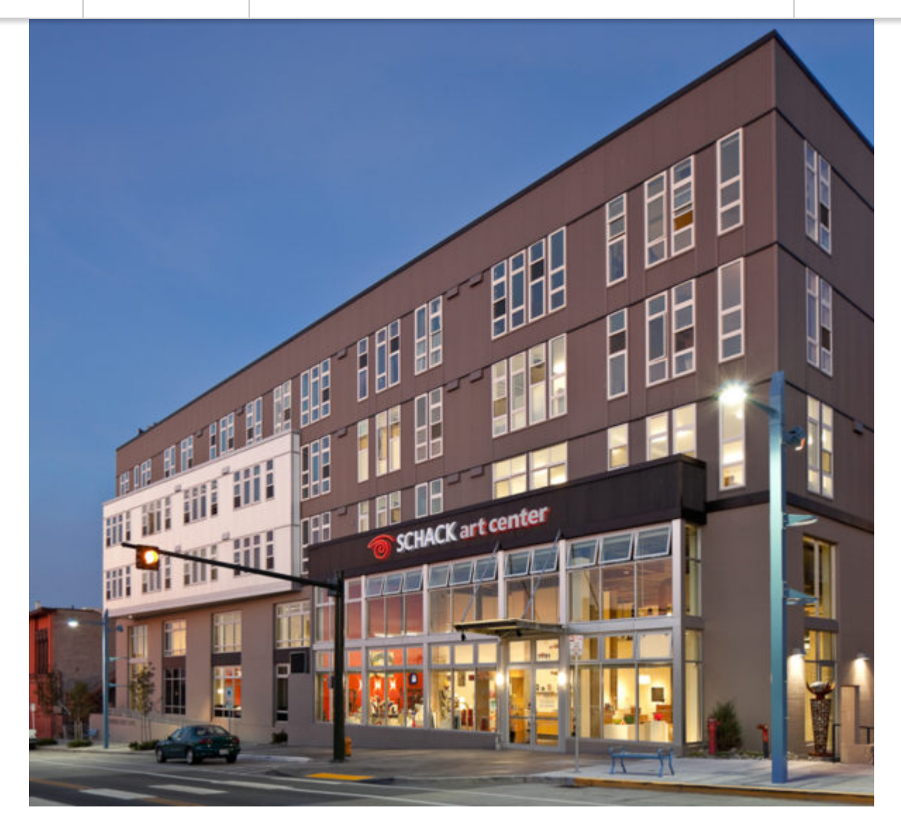
June 20 - August 24, 2024 NWDC is excited to announce NWCraft24 at Schack Art Center!

NWDC will present an exhibition of NWDC artists at the Schack Art Center from June 20 - August 24, 2024. Workshops and events will be hosted at Schack and other local partners in the first week of the exhibition in June 2024.