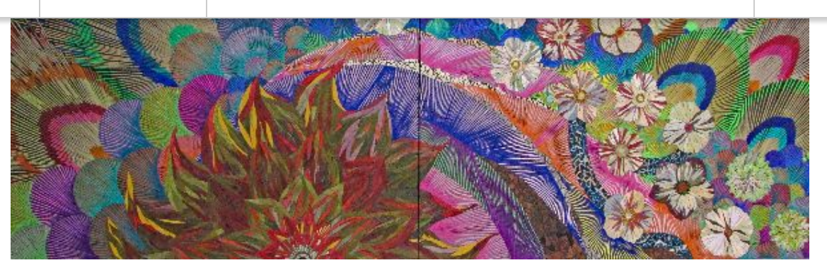
July 29 - August 6, 2023 Arts at the Port Anacortes Arts Festival Anacortes, WA

Naoko Morisawa's pieces On The Way to the Invisible Land- Shangri-La, Peacock, and Horizon II were selected to be included in Arts at the Port for the Anacortes Arts Festival.