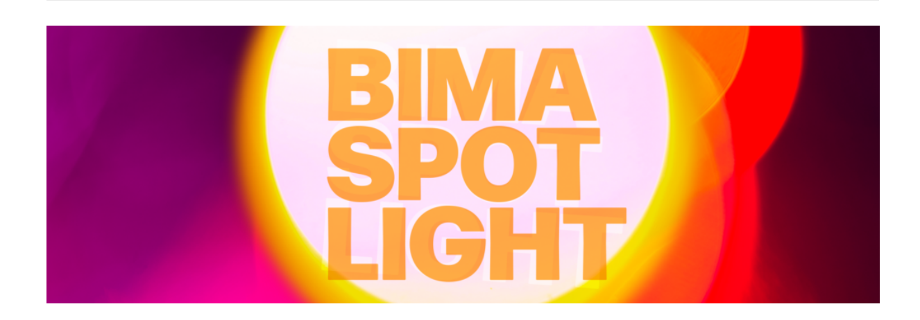
Jun 30 - Sep 10, 2023 BIMA Spotlight - Juried Exhibition

"One of the client's more humorous requests was that the gate be configured to also keep out foxes, which are numerous on San Juan Island." ~ Denise