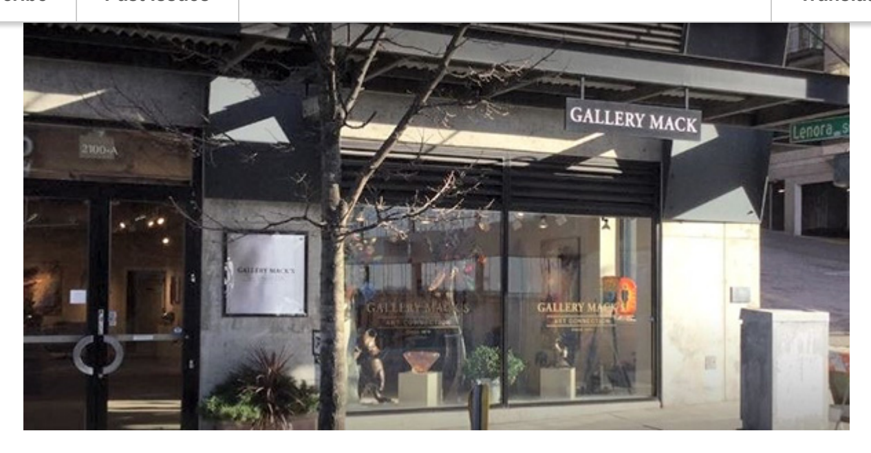
Winter 2023 / 2024 Gallery Mack Seattle, WA

NWDC will present an exhibition by current NWDC members at Gallery Mack this coming winter. Members will submit artworks to be chosen by the curatorial team at Gallery Mack and/or a guest curator. This exhibition will be focused on one type of craft media that has yet to be determined.