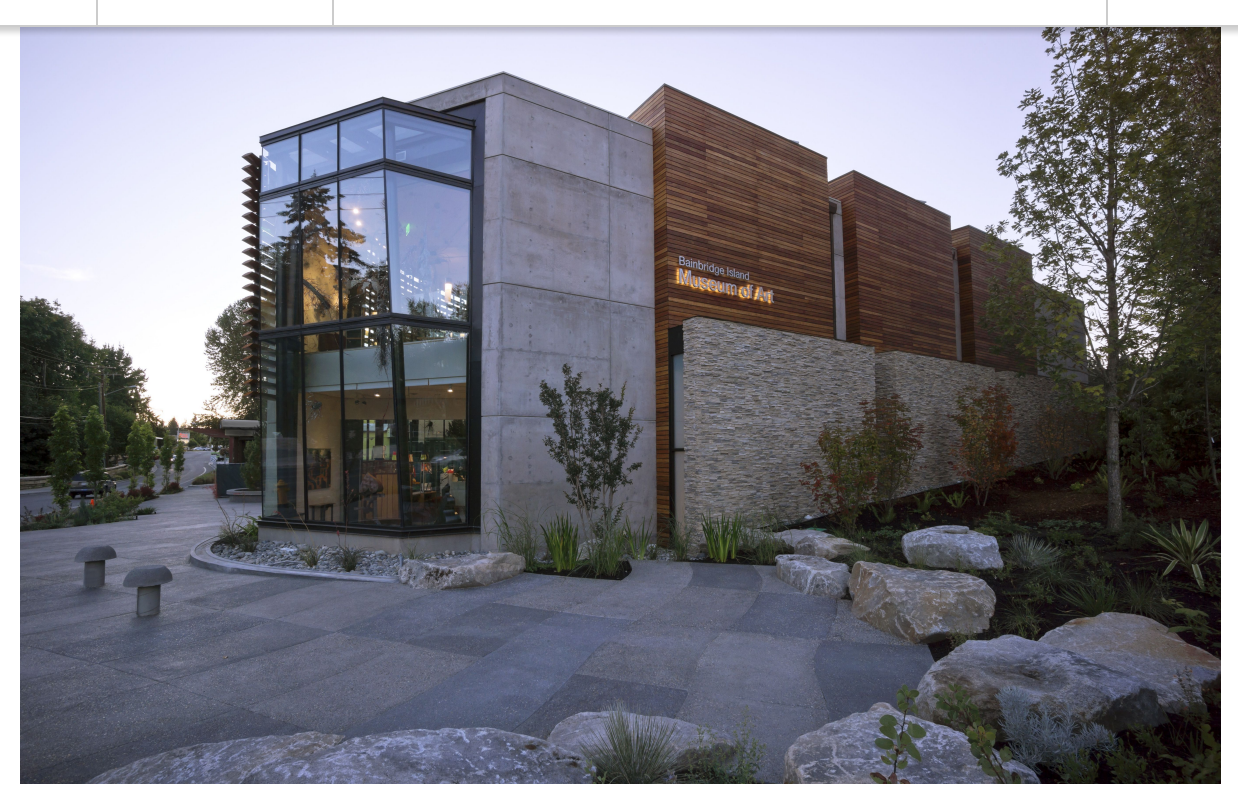
Fall 2024 Bainbridge Arts & Crafts / Bainbridge Island Museum of Art

NWDC will present an exhibition of artwork by current NWDC members at Bainbridge Arts & Crafts. The exhibition will integrate public programs presented at BIMA (Bainbridge Island Museum of Art). The exhibition and programs will coincide with BIMA's ongoing focus on Jewelry Art. NWDC's exhibition will expand the theme of Jewelry Art to include artists using non-traditional media to create adornments and artists using traditional jewelry-making materials experimentally.