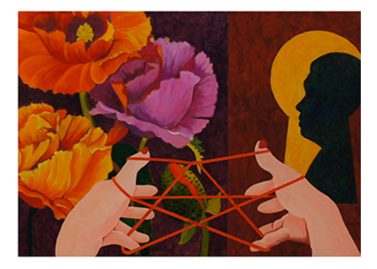
June 13, 2023, at 6:30 - 8:30 PM "Larger Than Life" by Cheryll Leo-Gwin Stroum Jewish Community Center

Image: Naoko Morisawa, On the way to the invisible land- Shangri-La, Handcrafted, Oilstained, wood and paper mosaic collage, acrylic, Japanese paper. 30 x 80 inch Diptych, 2022.