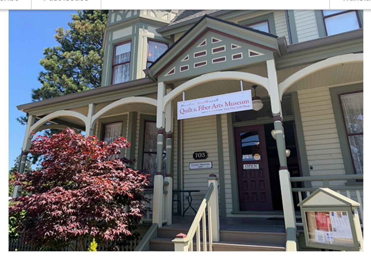
Spring 2024 Pacific Northwest Quilt & Fiber Arts Museum

NWDC will present a fiber art exhibition by current NWDC members in collaboration with the Pacific Northwest Quilt & Fiber Arts Museum. Members will submit artworks to be chosen by the curatorial team at the Pacific Northwest Quilt & Fiber Arts Museum and a special guest curator.