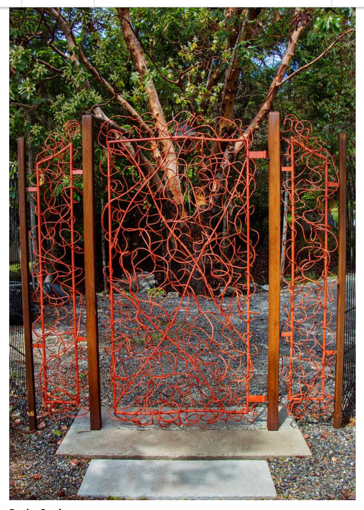
Denise Snyder Madrona Gate Painted Bent Steel, 8' x 8' x 9" Private residence — San Juan Island