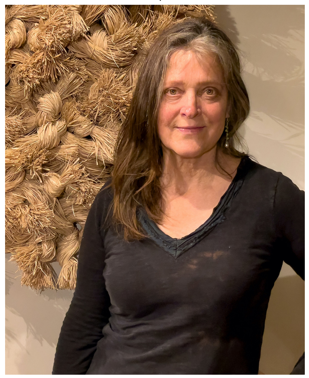
Images: Many Tranquil Moments | Knotted Raffia | Lilac-Hazelnut | Transition VIII | Effervescent Energy