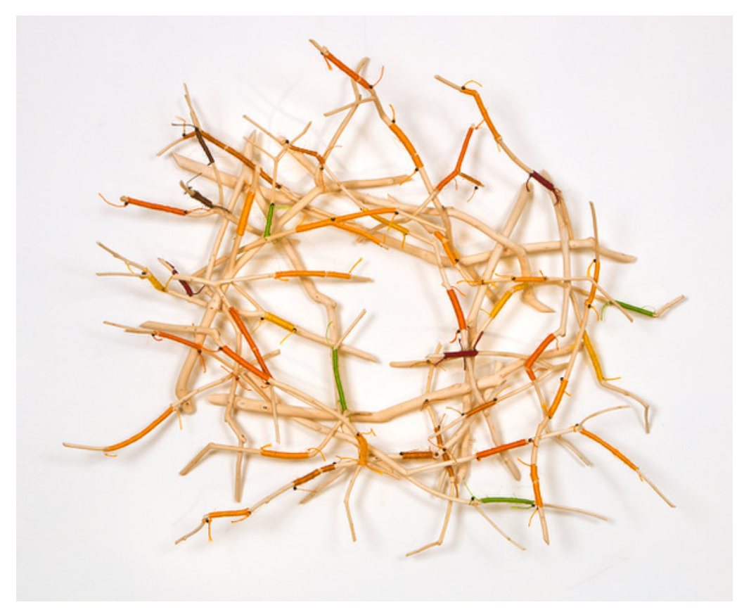
Shrine of the Sun Worshippers

Peeled Lilac, fique fiber, copper wire, beads 26" x 30" x 8" Denise Snyder