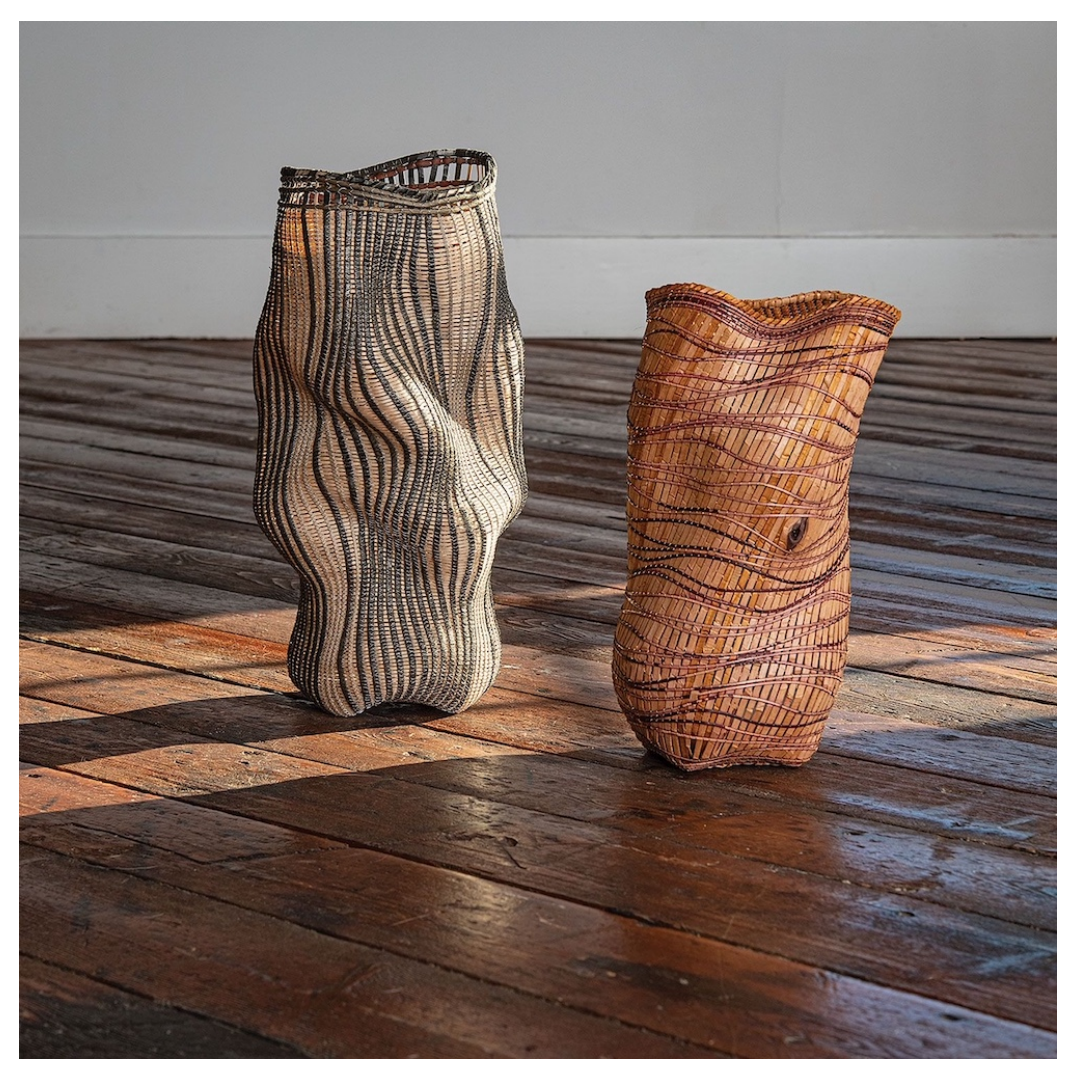
Black Bee and Onde del Mare Polly Sutton