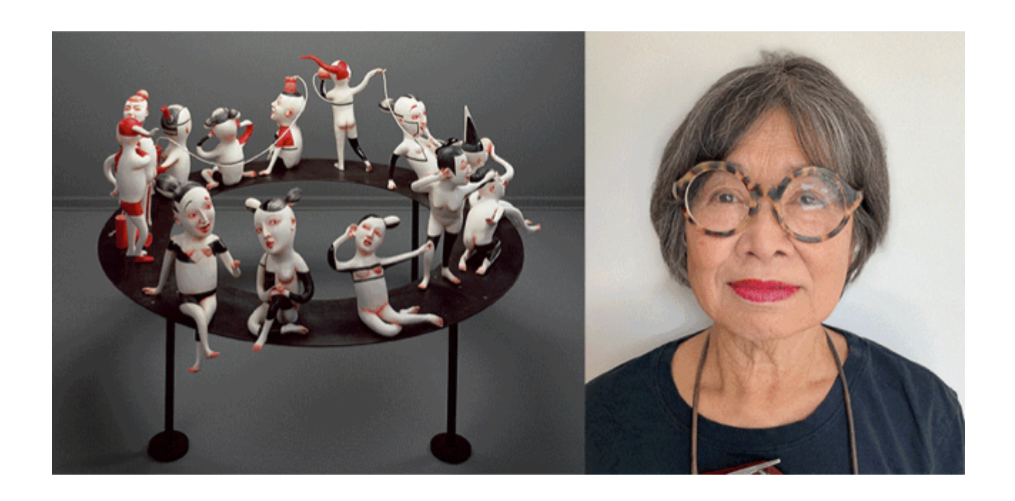
College of Fellows Award: