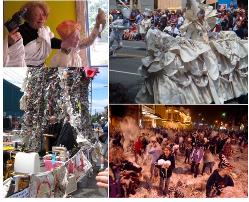
Clockwise from upper left in the collage:

Find your local number: https://us02web.zoom.us/u/kzNB2abT6