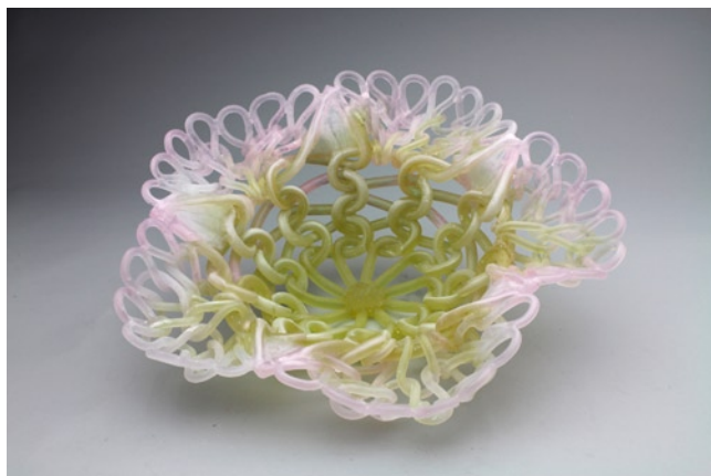
Whoop, 2014, kiln cast lead crystal, 6”H x 16”diameter