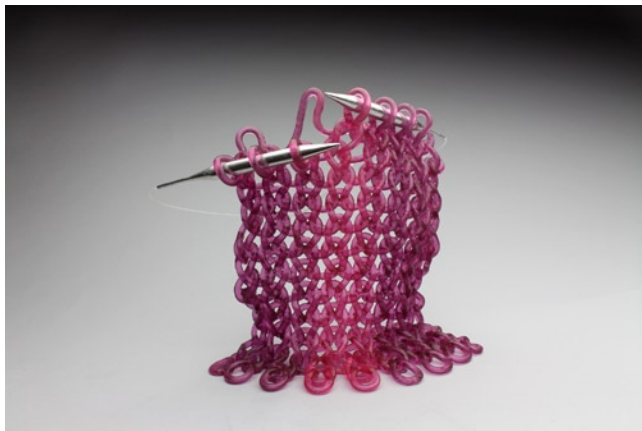
Wabi Sabi (commission), 2014, kiln cast lead crystal & knitting needles , 10” x 10” x 5”