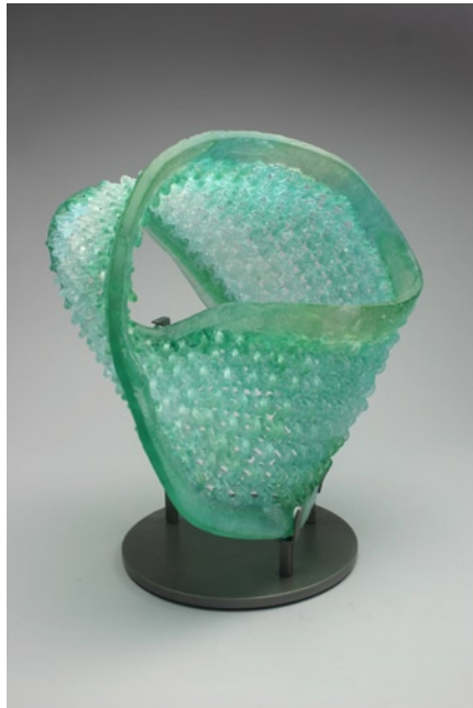
What Goes Around Comes Around, 2013, kiln cast lead crystal & steel stand, 16”x15”x14”