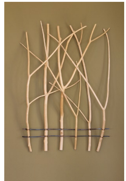
Denise Snyder's, "Testament to Spring"