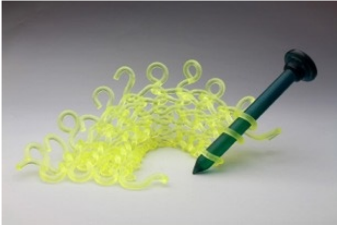
Radiate, 2014, cast glass (uranium glass & lead crystal), 7”H x 14” x 16”

“I see my knitted work as metaphor for social structure. Individual strands are weak and brittle on their own, but deceptively strong when bound together. You can crack or break single threads without the whole structure falling apart. And even when the structure is broken, pieces remain bound together. The connections are what bring strength and integrity to the whole and what keeps it intact.”