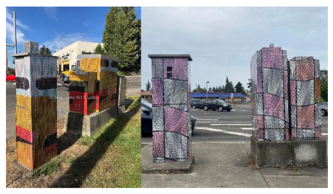
The City of Sea-Tac and Lynnwood Washington have adapted two designs by Naoko Morisawa for the UTILITY BOX ART PROGRAM. There will be total of 10 Installations in PNW.

Naoko Morisawa's contribution, PINK ICHIMATSU is located at Kent-Des Moines Road/ Pacific Hwy S; Center Island, NE Corner, Lynnwood, WA